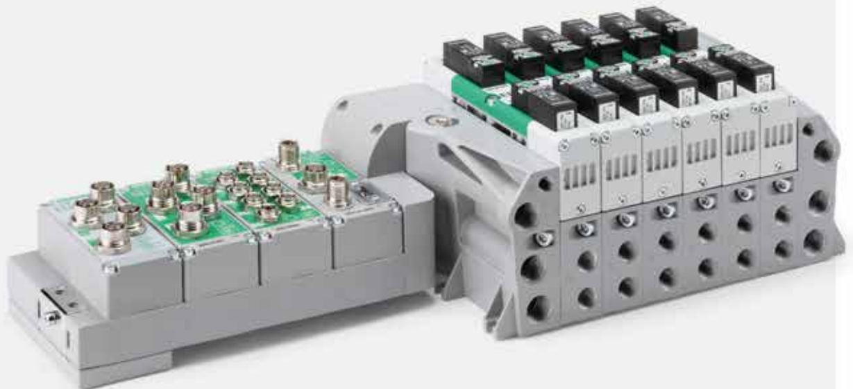
2700 EVO Series