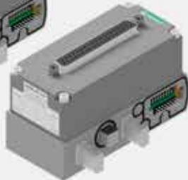
Sub-D 37 poles